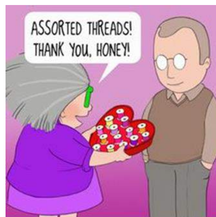
Valentine's Day with a quilter.