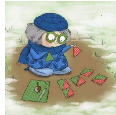
Piece on Earth

Our November Food Bank donations. Thank you! Please keep them coming.