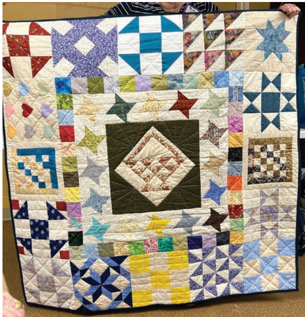
Maria S. 2 Charity Quilts 3-Yard Quilts Blue Sunflowers Pink Florals