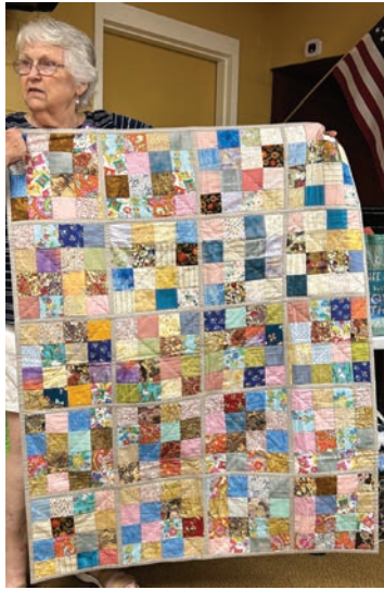
Sophie K. Charity Quilts Using up the little pieces