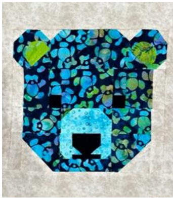
January Teddy Bear