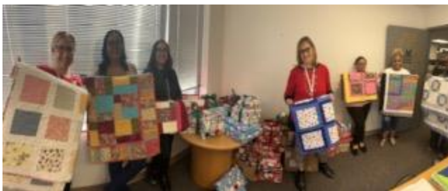
Photos of our quilts with staff from NJ Department of Children and Families