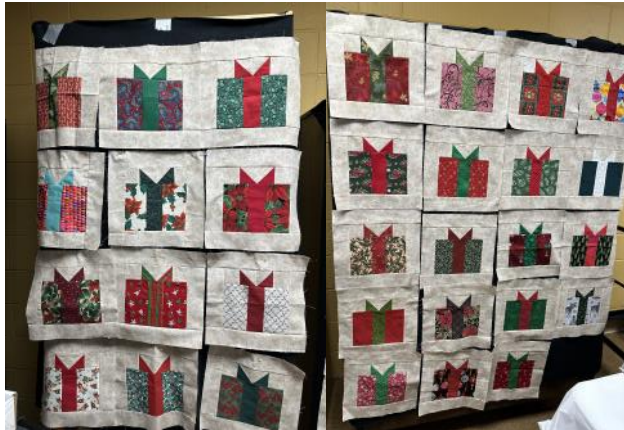
December Gift Wrap