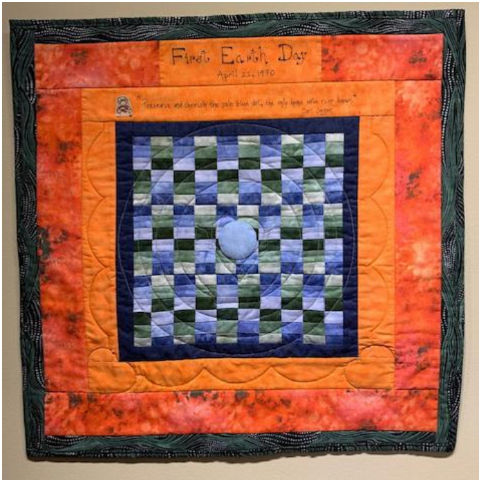
First Earth Day Paula Patri