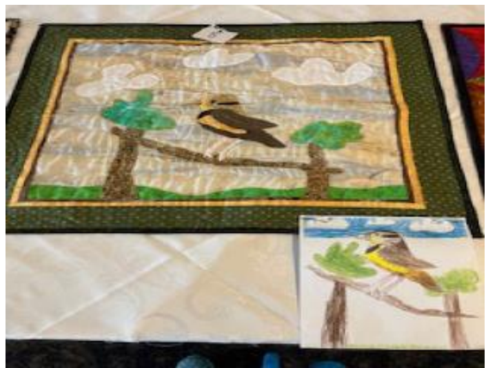
Bird in Spring Sophie Keidel