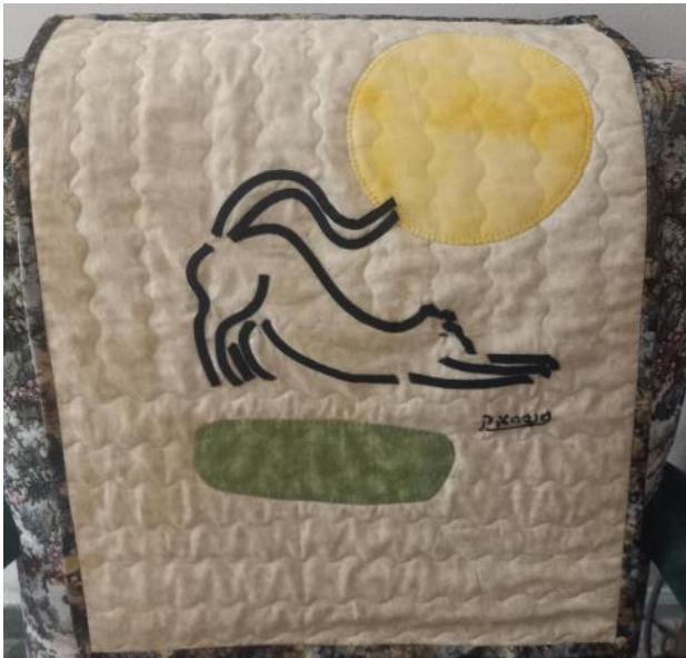
Stretch Ginger Cullern