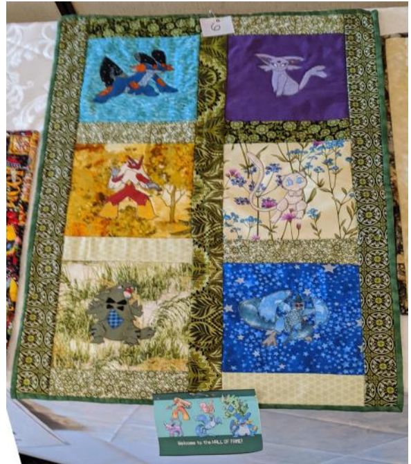
Pokemon Emerald Nuzlocke Team Emilie Snyder