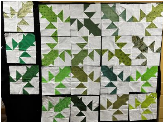
March It's not easy being green