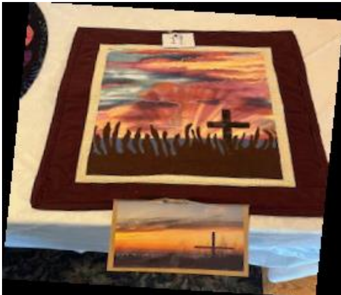
Dawning of a New Day Sherre MacClellan