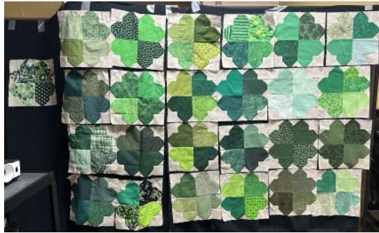
March Four-Leafed Clover